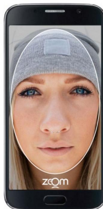
Conversely, no distortion occurs with 2D objects like photos or videos. FaceTec's proprietary algorithms capture ~30 video frames while tracking the motion of the device. The result is a dynamic perspective, 3D face authentication from a standard 2D camera.