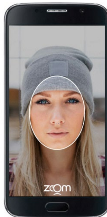
ZoOm observes the user's head, neck, ears, hair, facial features and their environment as the camera is moved closer to the face. During the motion, the camera's view of the face changes and perspective distortion will be observed if the face is 3D.